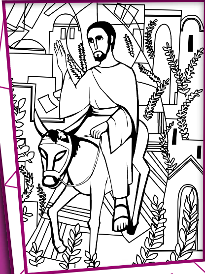
Sunday 24 th March