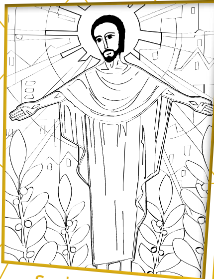
Sunday 31 st March