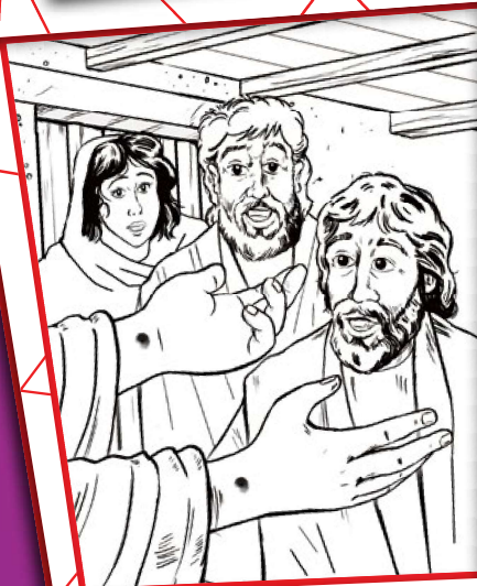
Sunday 7 th April