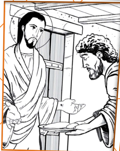
Sunday 14 th April